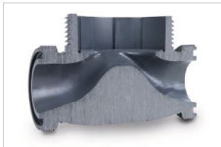
Optimized flow thanks to innovative design